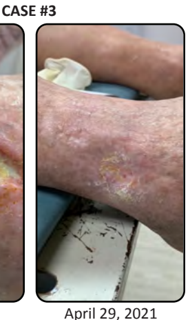
• 57-year-old white male presents with ischemic eschar of the 2nd right digit and eschar of the anterior distal hallux with pain on palpation.